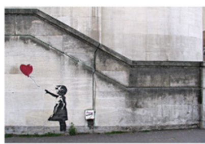
Banksy a celebrated British street artist