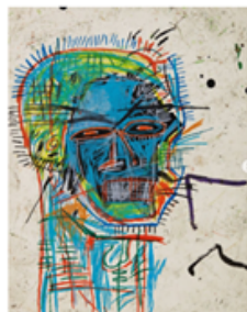
Jean-Michel Basquiat (1960-1988) a celebrated American artist