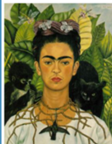
Frida Kahlo (1907-1954) was a celebrated Mexican artist